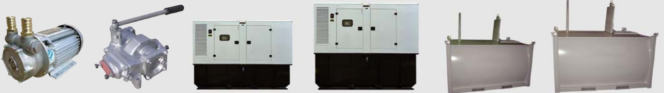
Auto filling fuel pump